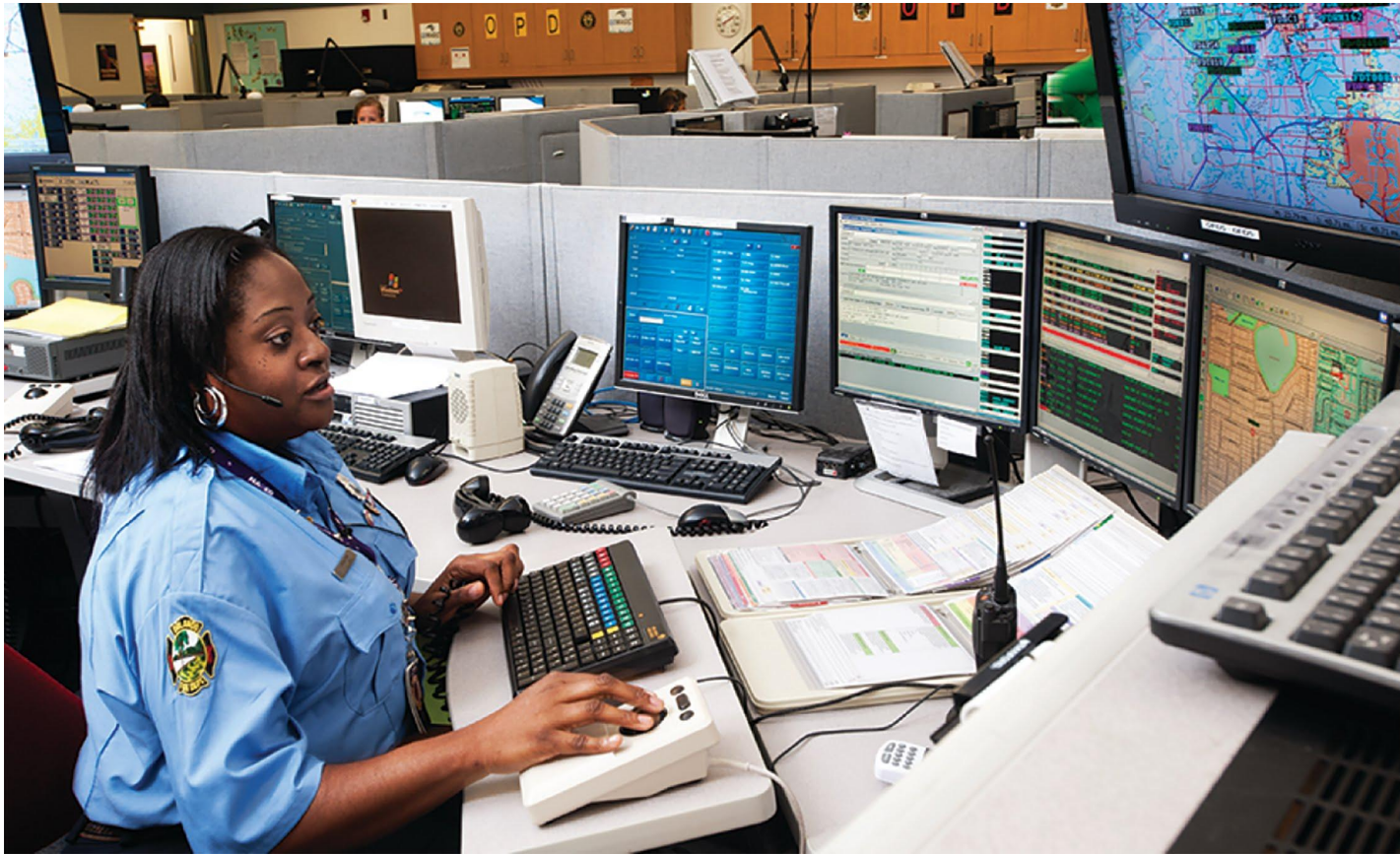
Emergency medical dispatchers