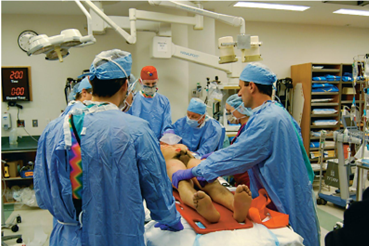
Emergency department staff